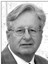
Donald Meichenbaum, Ph.D.

Donald Meichenbaum, Ph.D. , is Research Director of The Melissa Institute and Distinguished Professor Emeritus at the University of Waterloo, Ontario, Canada. He has served as Distinguished Visiting Professor at the University of Miami School of Education. He is one of the founders of Cognitive Behavior Therapy. North American clinicians voted Dr. Meichenbaum "one of the 10 most influential psychotherapists of the 20th century." He recently received a Lifetime Achievement Award from the Clinical Division of the American Psychological Association.