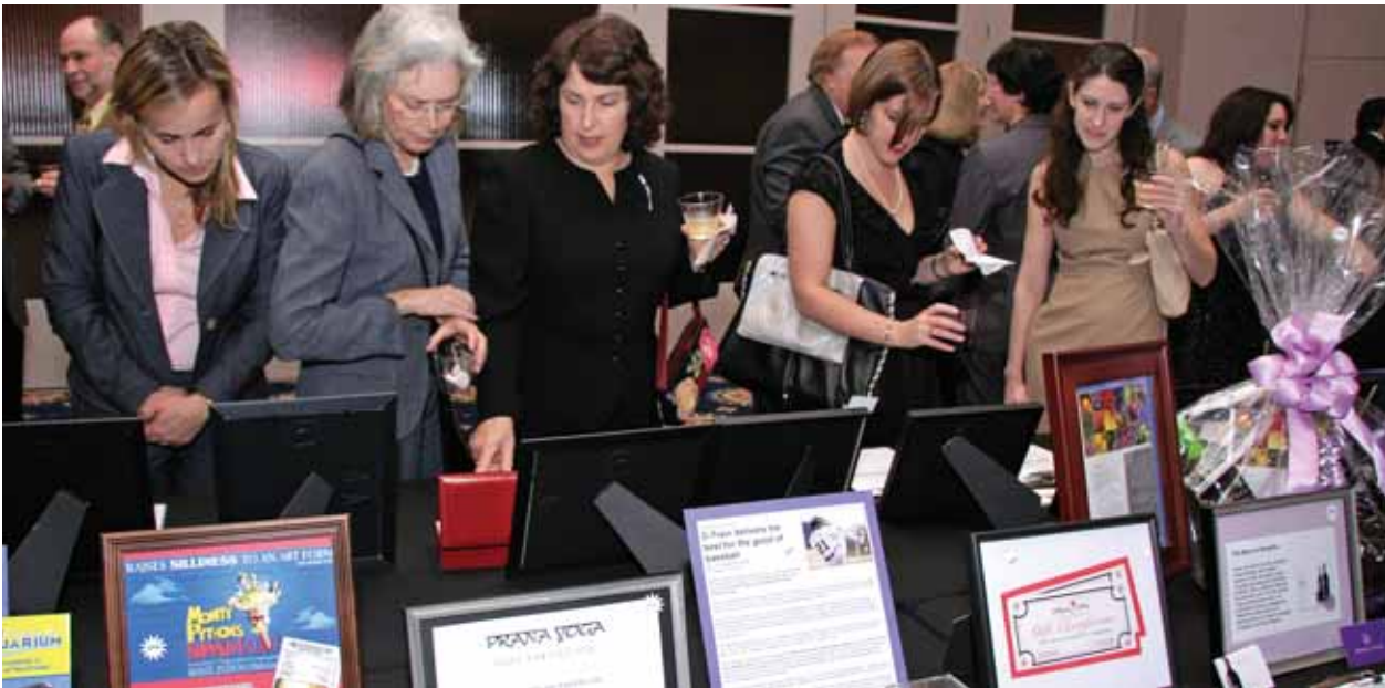
◀ Silent auction supporters check their bids.