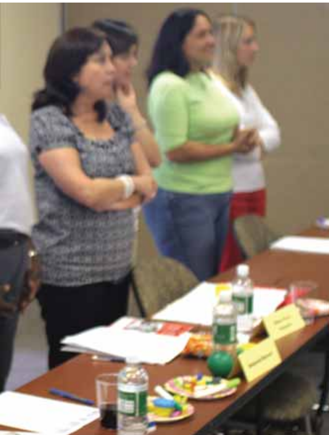
Against Violence workshop attendees.