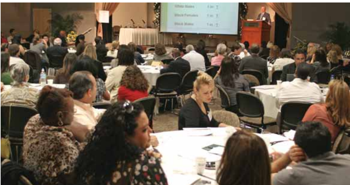
Law enforcement officers, school personnel, community agency leaders and public policy makers participated in Silence the Violence.