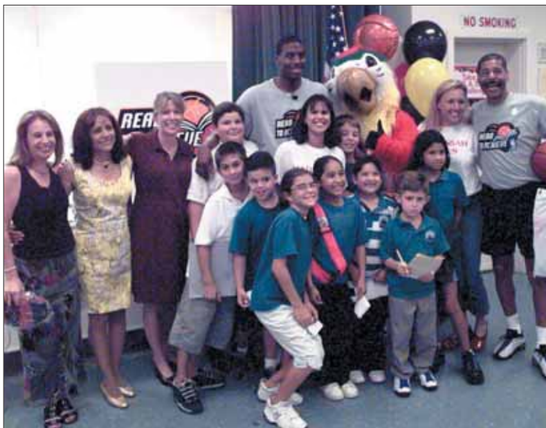
Above left : Miami SOL mascot "Solee" delighted students at Sylvania Heights Elementary, where the Read Write Now tutoring program takes place. Left: Miami HEAT star Eddie Jones (center) is surrounded by students, faculty and tutors at the Read Write Now kick-off event. Below: He spoke about the importance of reading for success in school.