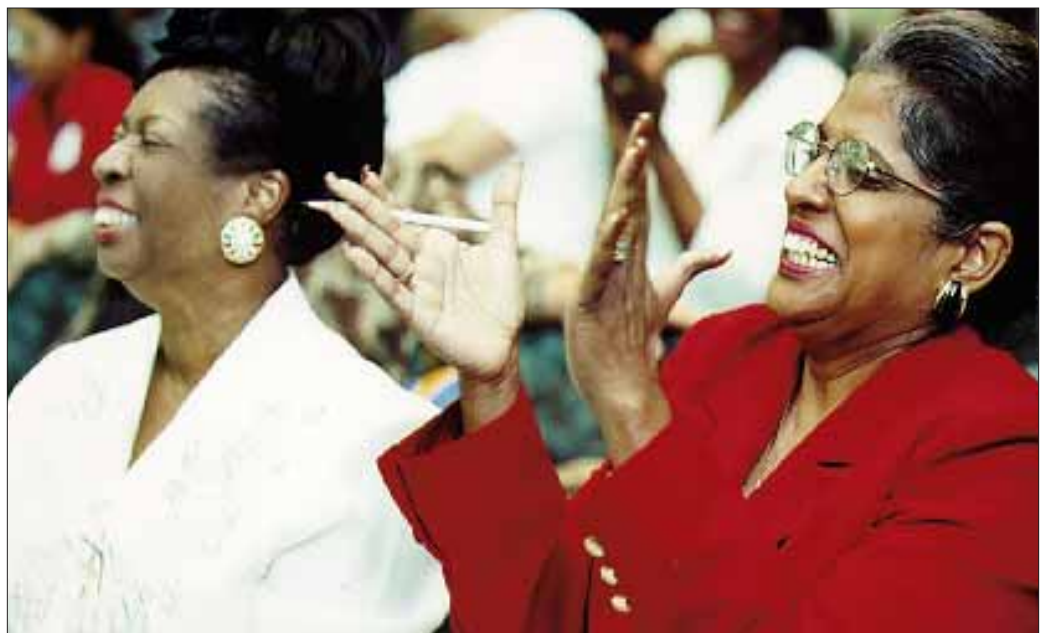
Hundreds of participants attended the forum on school violence prevention.