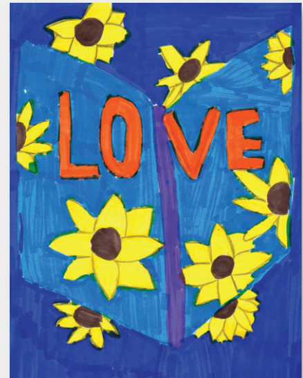
Yuliett Pulido, 9 years old, Tucker Elementary