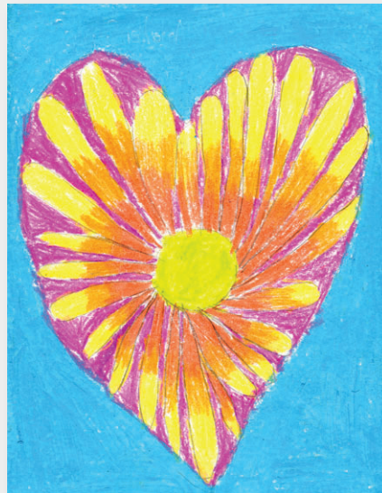
Amalia Suros, 8 years old, Tucker Elementary