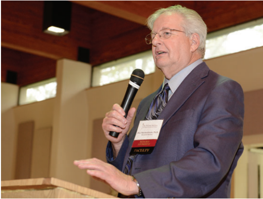
Donald Meichenbaum, Ph.D., Scientific Director of The Melissa Institute, has organized 18 annual conferences to provide evidence-based research on violence prevention.